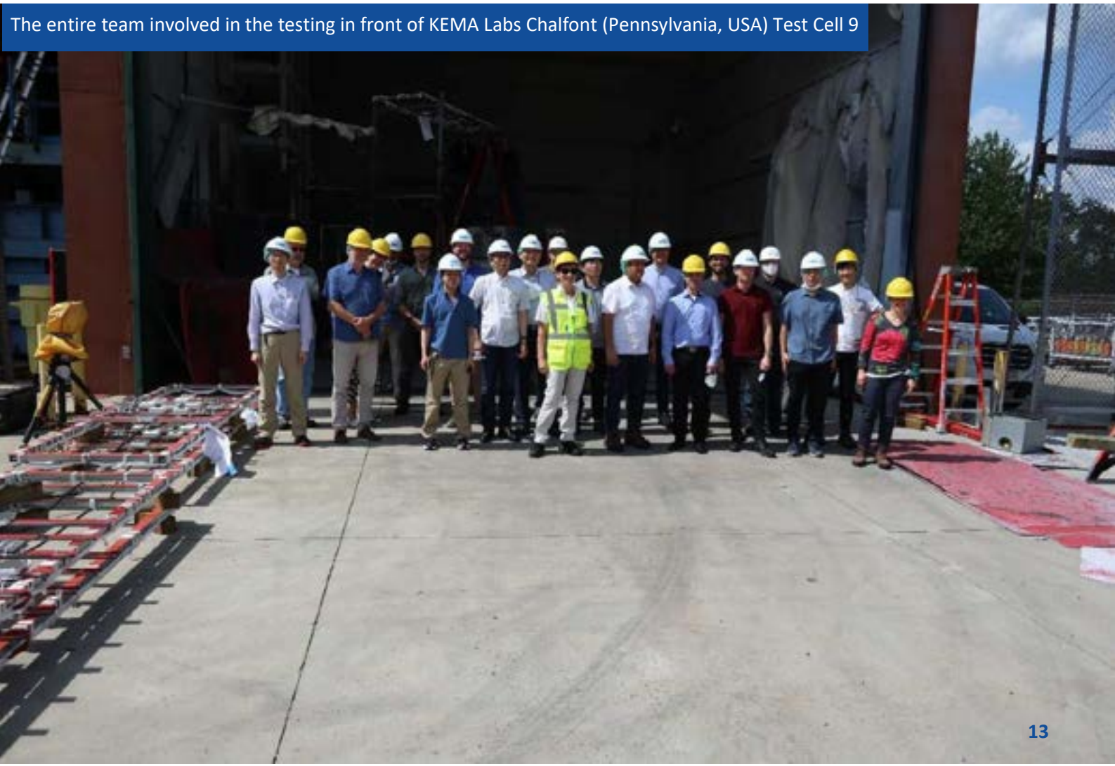
The entire team involved in the testing in front of KEMA Labs Chalfont (Pennsylvania, USA) Test Cell 9

In conclusion, ensuring the safety and reliability of electromechanical equipment is crucial for any end user of critical assets. Internal arcing faults, among other potential risks, can cause severe damage to equipment and pose a safety risk to personnel.